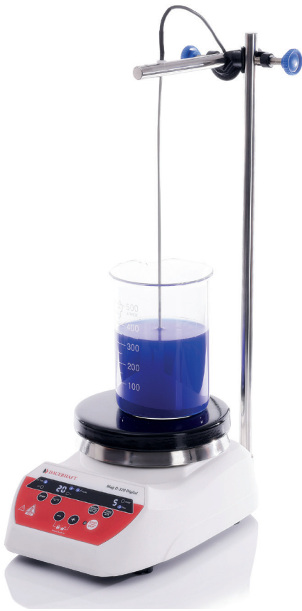
Stirrer with sample

It has a digital display that allows the visualization of multiple parameters such as actual and set temperature, speed, operating mode, among others. It is mainly used in laboratories, research centers and universities.