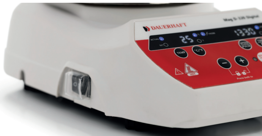
Display and switch