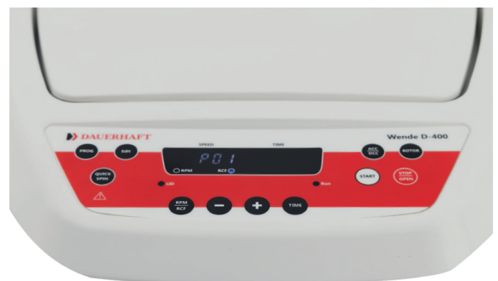
Interface and display