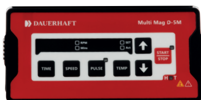
Display and interface